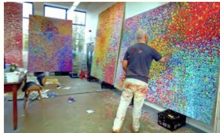
Hirst at work in his London studio, 2017

Hirst's most recent work was inspired by frontline workers during the COVID-19 pandemic and goes to support NHS Charities. While in quarantine, he took to Instagram to answer questions directly from his followers.