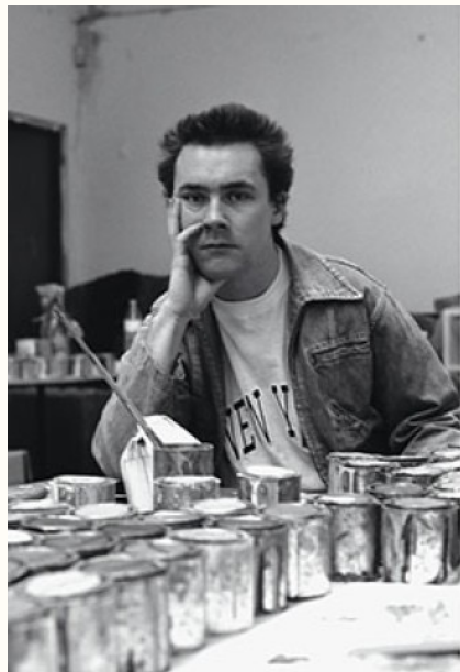
Hirst, 1988

Hirst's website – biography, press, writing, interviews, artwork