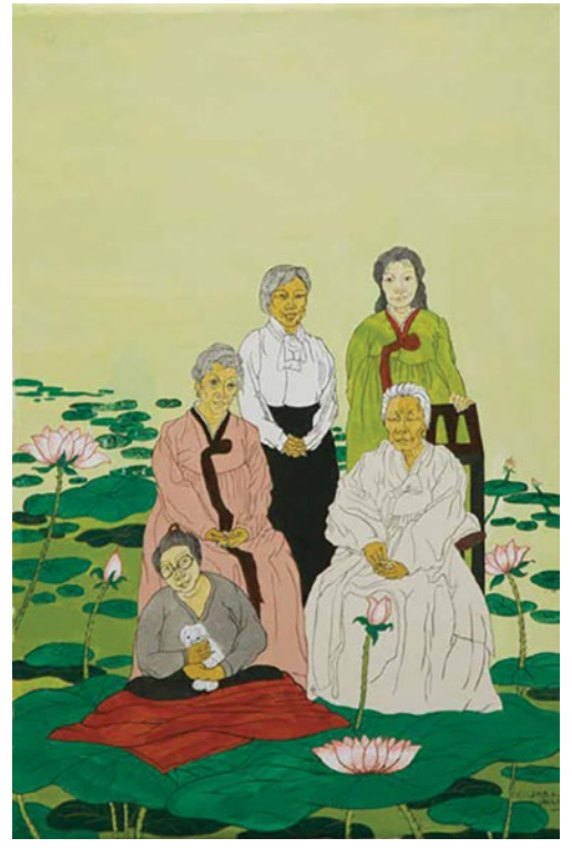
YUN Suknam (born 1939). We are a Matrilineal Family . Korean; Republican period, 2018. Ink and color pigment on hanji (Korean paper), 26 x 18 ½ inches. Farwest Steel Korean Art Endowment Fund Purchase; 2018:35.1

Both featured in the exhibition Graceful Fortitude: The Spirit of Korean Women