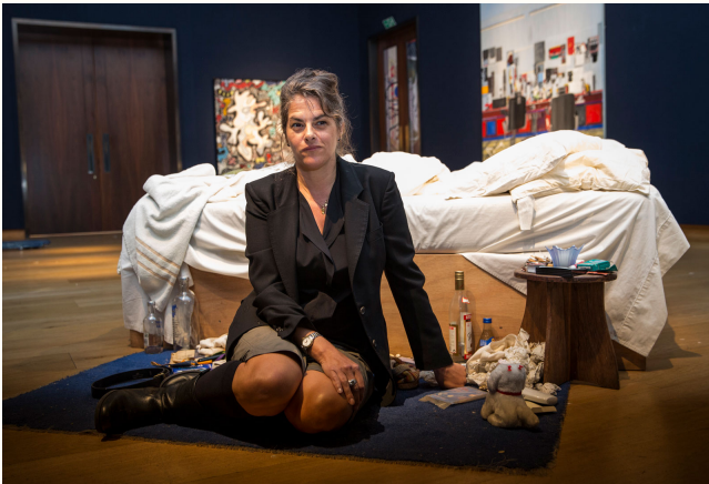
Emin in front of My Bed (1998), 2014

A 2008 exhibition entitled Tracey Emin: 20 Years at the Scottish National Gallery of Modern Art was Emin's first major retrospective. Read a review and click through an image gallery .