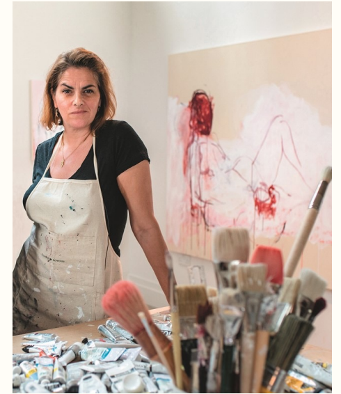
Emin in her east London studio, 2017

The British Pavilion for the Venice Biennale selected Emin, the second woman ever, for its 52 nd edition in 2007. Tour the exhibition in a video .