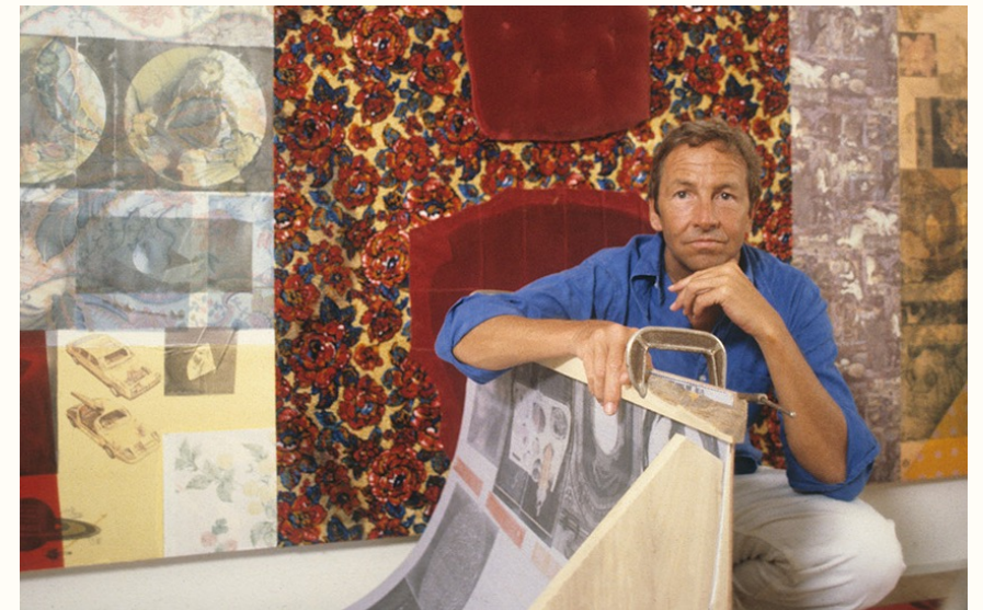
Rauschenberg, 1980

The Robert Rauschenberg Research Project : a collection of scholarship and archival documents related to works in SFMoMA’s permanent collection of the artist’s work.