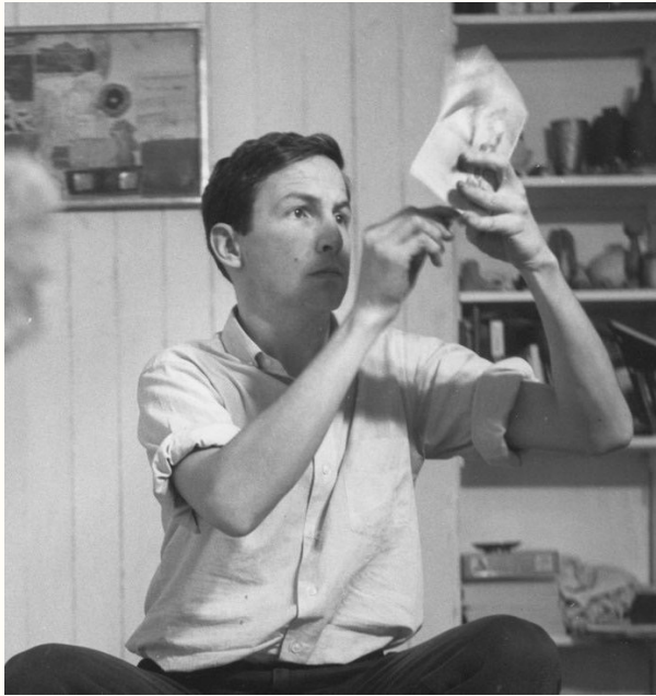
Rauschenberg in NYC studio, 1958

Robert Rauschenberg Foundation : biography, artwork, publications, and archives; grants and residencies