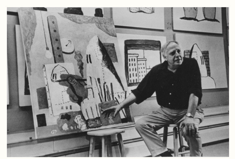
Guston with The Studio (1969), 1969