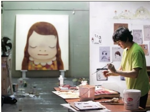
NARA in New York, 2010

Nara’s first solo exhibition in Hong Kong , in 2015, brought together paintings, mixed-media drawings, photographs, and sculptures to capture twenty years of the enigmatic artist’s explorations of interior life. “Instead of capturing one moment or creating something out of temporary emotion, I think I’m trying to create something more permanent in both artistic and aesthetic aspects,” Nara reflected in a video interview .