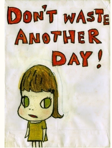
NARA Yoshitomo 奈良美智 (Japanese, b. 1959) Don't Waste Another Day! , 2007 Colored pencil on paper