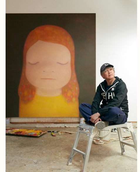
Nara in Tochigi Prefecture studio, 2020

Two major surveys of Nara’s work are scheduled to re-open to visitors in 2021. At Dallas Contemporary , paintings, drawings, and sculptures will trace the artist’s career from 2006. At LACMA , thirty years of work explore Nara’s interests in childhood, music, literature, Europe, Asia, and modern art. A monumental outdoor sculpture and an installation recreating his drawing studio complete the expansive retrospective , which will travel to the Yuz Museum in Shanghai, Guggenheim Bilbao, and Kunsthal Rotterdam. The New York Times Style Magazine: Singapore dropped by his Tohigi Prefecture studio for a lighthearted conversation .