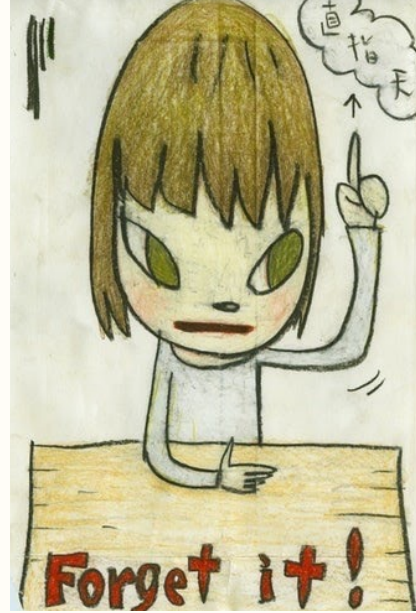
NARA Yoshitomo 奈良美智 (Japanese, b. 1959) Forget it! , 2007 Colored pencil on paper