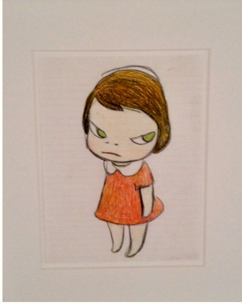
NARA Yoshitomo 奈良美智 (Japanese, b. 1959) Knife Behand Back , 2000 Colored pencil on paper

On view October 7, 2020 – January 10, 2021