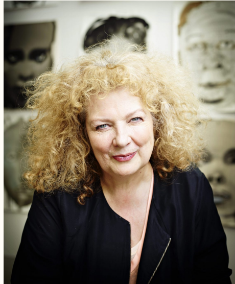
Dumas, 2014

In 2014, Dumas participated in Manifesta 10 , a contemporary art biennial at the Hermitage Museum in St. Petersburg, Russia. She mounted her series, Great Men , 16 portraits of gay men, in an act of protest against the nation's anti-gay legislation. In a poem conceived for the exhibition, Dumas wrote: “Art is there to help us to see more and not less / Laws are there to help us to love more and not less / Laws should protect us from hatred and not from love.” Watch Dumas talk with the Tate Modern about the series.