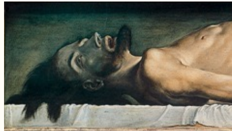
The Body of the Dead Christ in the Tomb , 1521 (detail)

Marlene Dumas has lived and worked in the Netherlands since leaving her birthplace of Cape Town, South Africa in 1976. Dumas is best known for portraits, although the term only narrowly describes her creations. She never works from life, preferring the distance of art historical reproductions and photographs of herself and her family, as well as celebrities, literary icons, artists, and political figures. Seeking out the ambiguity of intense emotions and complex experiences, Dumas renders intangible subjects (death, sex, and shame are favorites) in figurative form. Like Don Quixote takes its pale profile from German Renaissance painter Hans Holbein's life-size The Body of the Dead Christ in the Tomb (1521). Removed from its original context and given the suggestive simile of a title, the anonymous face glows with a ghostly hue created by thinned layers of paint: a mask of insubstantial flesh that provides no reassurance of identity, time, or place.