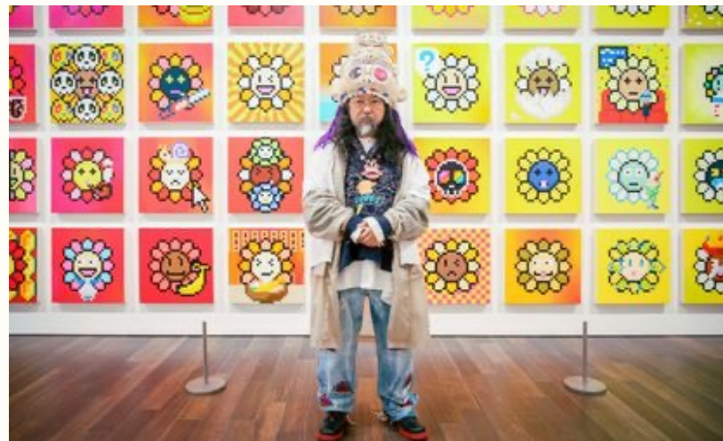
Murakami in San Francisco, 2023

In 2017, The MFA Boston launched Takashi Murakami: Lineage of Eccentrics, a Collaboration with Nobuo Tsuji and the Museum of Fine Arts, Boston . The project and exhibition created a dialogue between Murakami and the famed art historian, Nobuo Tsuji, who put Murakami's work in conversation with Japanese masterpieces from the MFA's collection. Read a review in the Boston Globe calling it: "Fun, fun, fun."