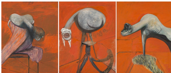
Francis Bacon Three Studies for Figures at the Base of a Crucifixion , 1944 Oil and pastel on board Tate Britain