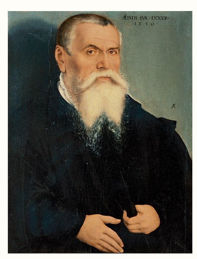
Lucas Cranach the Younger Lucas Cranach the Elder, portrait at age 77, c. 1550 Oil on panel Uffizi Gallery, Florence

The Grunewald Hunting Lodge has a permanent display entitled <u>Cranach in Grunewald: Masterpieces by Lucas Cranach the Elder, The Younger, and Their Workshop</u>, featuring nearly thirty masterpieces that document the Berlin royal court in the sixteenth century.