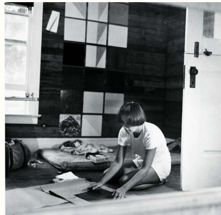
Bartlett in her studio, ca. late 1960s