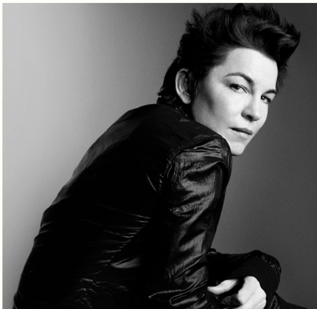
Peyton, 2018

2008 also saw Peyton’s first retrospective tour internationally, at the New Museum in New York followed by The Walker Art Center and Whitechapel Gallery in London.