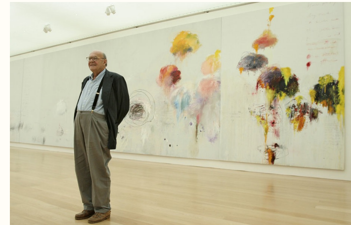
Twombly, 2005

Gagosian Gallery in London presented an exhibition of Twombly's sculptures in 2019 , celebrating the release of volume two of his catalogue raisonné . Twombly began experimenting with sculpture in the 1940s, creating assemblages of plaster, wood, iron, and found materials in his studio, which he frequently painted white – a nod to the marble sculptures of antiquity.