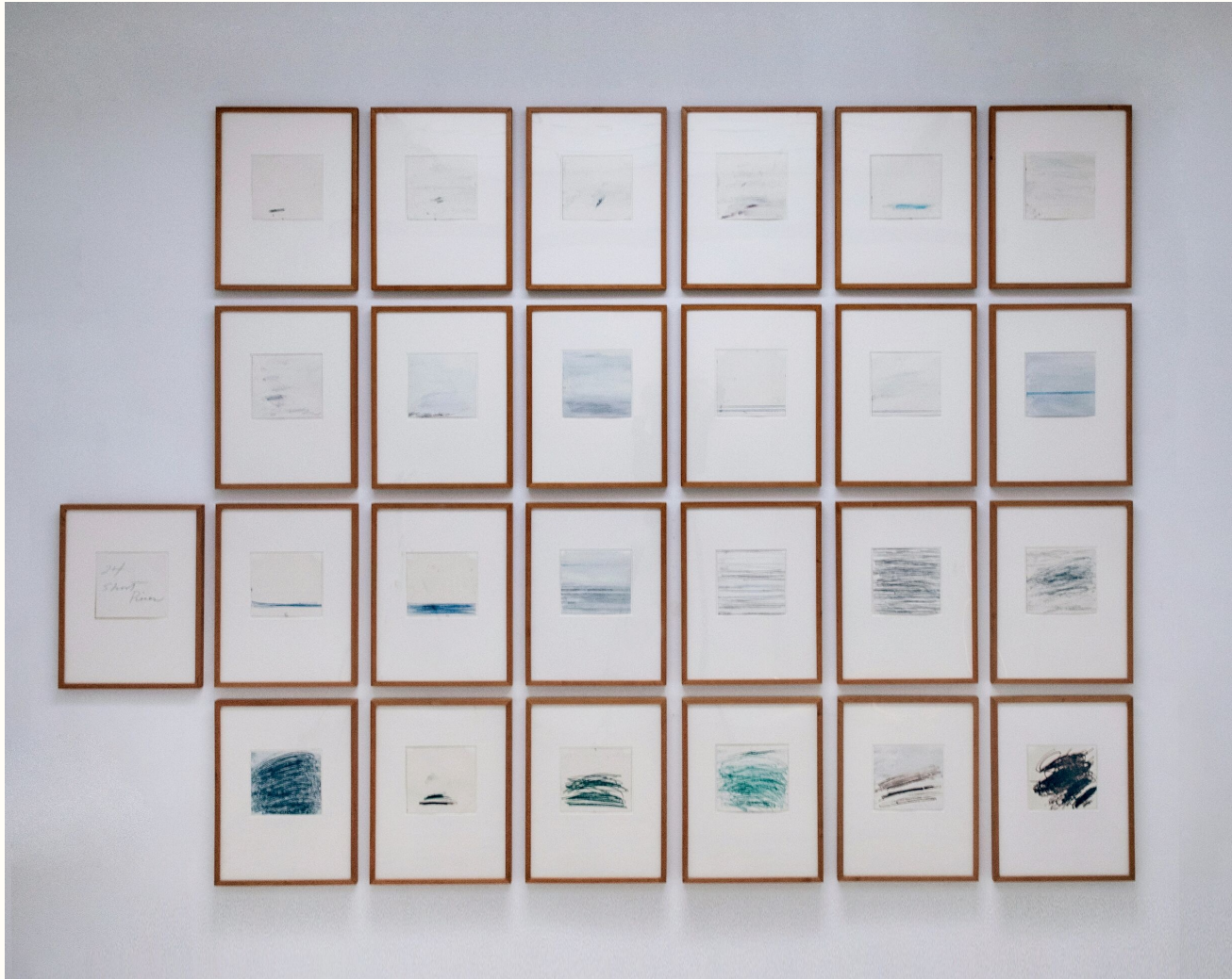
Cy Twombly (American, 1928-2011) 24 Short Pieces , 1973 House paint, crayon, pencil on paper, 25 sheets