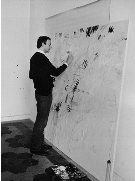
Twombly in Rome studio, 1962