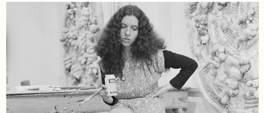
Kruger in her New York studio, ca. mid-1970s

In 2022, The Institute of Contemporary Art Boston commissioned Kruger to create Untitled (Hope/Fear) , which is on display until 2024.