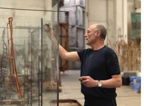
Kiefer in his studio

Fondazione Palazzo Strozzi installed <u>Anselm Kiefer: Fallen Angels</u> in 2024, featuring both new and historical works in dialogue with the Palazzo's Renaissance architecture.