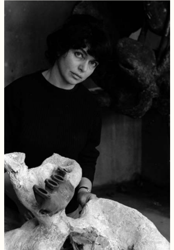
Szapocznikow, Paris, 1964