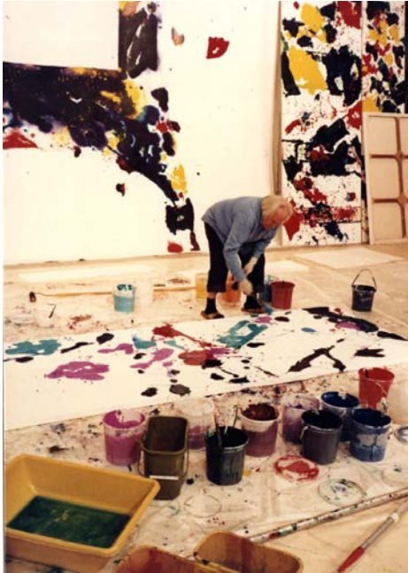
Francis at work in Santa Monica studio, 1983

Sam Francis: Rapid Fluid Indivisible Vision opened at the Bechtler Museum of Modern Art in North Carolina in 2015, placed Francis in proximity to artists he influenced, gained inspiration from, and collaborated with.